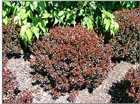
Midnight Ruby Barberry

This shrub does best in full sun to partial shade. It is very adaptable to both dry and moist growing conditions, but will not tolerate any standing water. It is considered to be drought-tolerant, and thus makes an ideal choice for a low-water garden or xeriscape application. It is not particular as to soil type or pH, and is able to handle environmental salt. It is highly tolerant of urban pollution and will even thrive in inner city environments. This is a selected variety of a species not originally from North America.