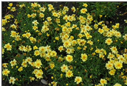
Galaxy Tickseed in bloom