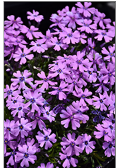
Purple Beauty Moss Phlox flowers

Purple Beauty Moss Phlox is recommended for the following landscape applications;