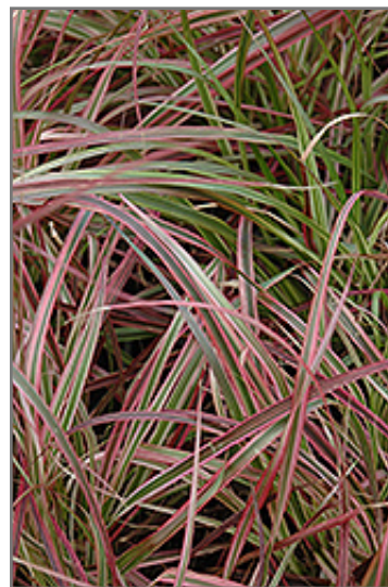
Fireworks Fountain Grass foliage