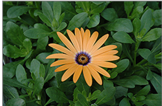
Orange Symphony African Daisy flowers