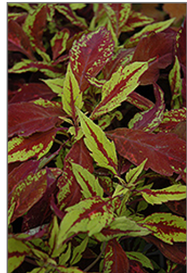
Pineapple Coleus foliage