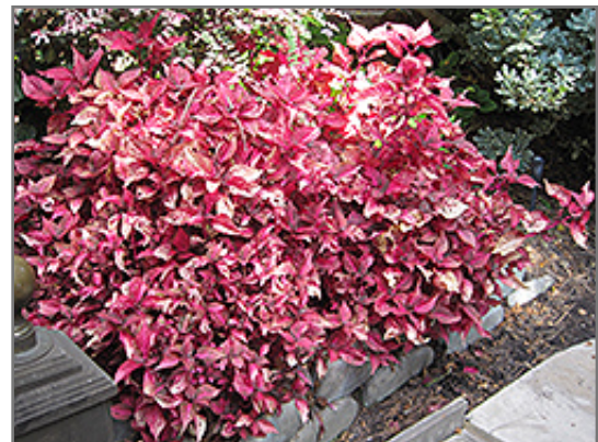
Blood Leaf