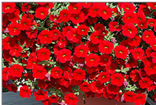
Cabaret Bright Red Calibrachoa flowers