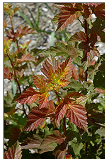
Amber Jubilee Ninebark foliage