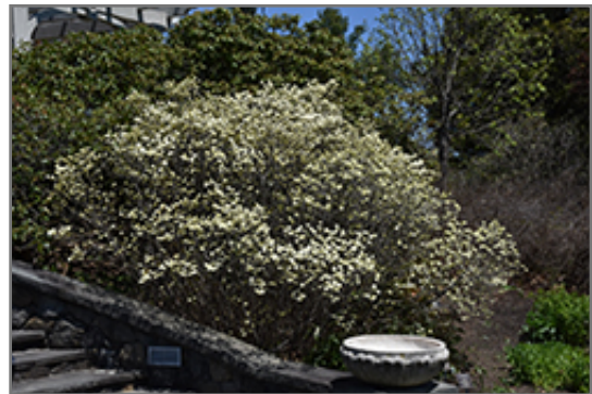
Dwarf Fothergilla in bloom

Dwarf Fothergilla is recommended for the following landscape applications;