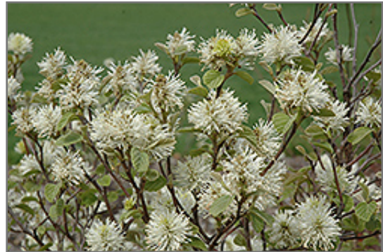
Dwarf Fothergilla flowers

This shrub does best in full sun to partial shade. It requires an evenly moist well-drained soil for optimal growth, but will die in standing water. It is not particular as to soil type, but has a definite preference for acidic soils, and is subject to chlorosis (yellowing) of the leaves in alkaline soils. It is somewhat tolerant of urban pollution. This species is native to parts of North America.