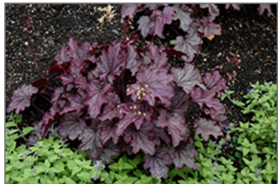
Spellbound Coral Bells