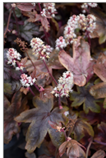
Brass Lantern Foamy Bells flowers