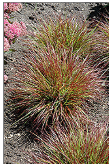
Burgundy Bunny Dwarf Fountain Grass