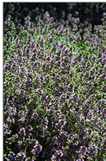
Lemon Thyme flowers

This is a dense herbaceous evergreen perennial herb with a spreading, ground-hugging habit of growth. It brings an extremely fine and delicate texture to the garden composition and should be used to full effect. This plant will require occasional maintenance and upkeep, and is best cleaned up in early spring before it resumes active growth for the season. Deer don't particularly care for this plant and will usually leave it alone in favor of tastier treats. Gardeners should be aware of the following characteristic(s) that may warrant special consideration;