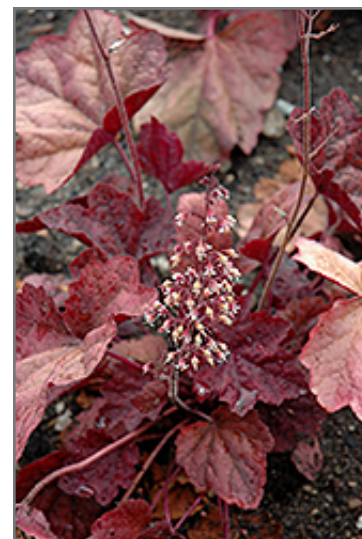
Lava Lamp Coral Bells flowers