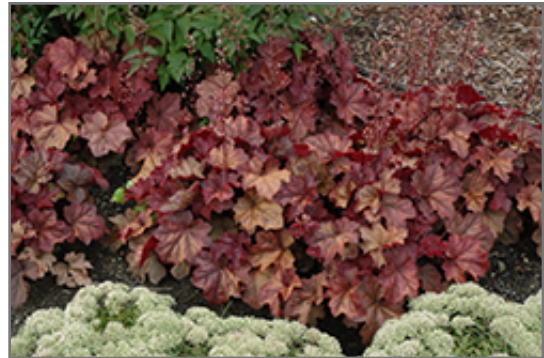
Lava Lamp Coral Bells

Lava Lamp Coral Bells will grow to be about 16 inches tall at maturity extending to 32 inches tall with the flowers, with a spread of 28 inches. When grown in masses or used as a bedding plant, individual plants should be spaced approximately 24 inches apart. Its foliage tends to remain dense right to the ground, not requiring facer plants in front. It grows at a medium rate, and under ideal conditions can be expected to live for approximately 10 years.