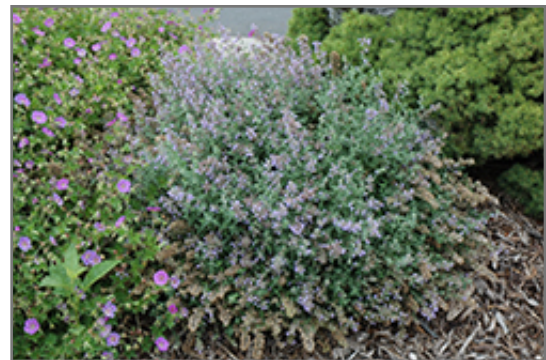
Cat's Meow Catmint in bloom