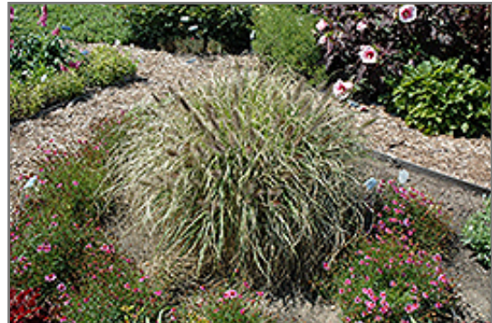
Ginger Love Fountain Grass