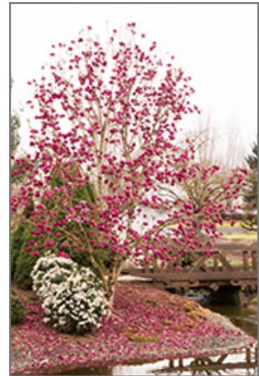
Black Tulip Magnolia in bloom