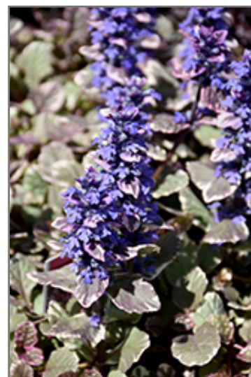
Burgundy Glow Bugleweed flowers