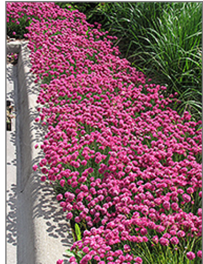
Dusseldorf Pride Sea Thrift in bloom

Dusseldorf Pride Sea Thrift is recommended for the following landscape applications;