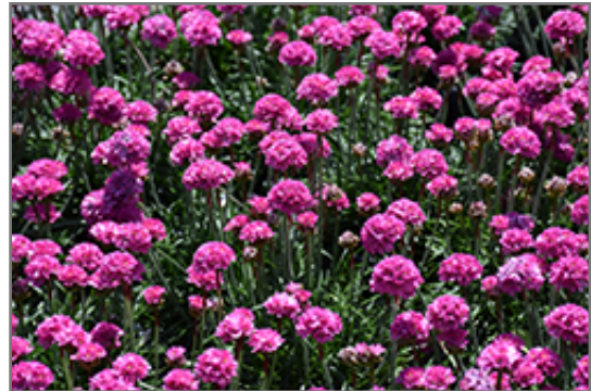
Dusseldorf Pride Sea Thrift flowers

Dusseldorf Pride Sea Thrift will grow to be only 6 inches tall at maturity extending to 8 inches tall with the flowers, with a spread of 8 inches. Its foliage tends to remain low and dense right to the ground. It grows at a slow rate, and under ideal conditions can be expected to live for approximately 10 years.