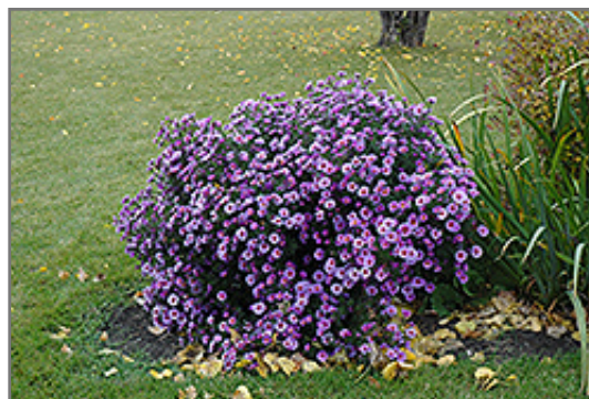
Purple Dome Aster in bloom