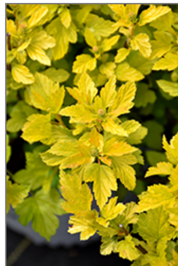
Tiny Wine Gold Ninebark foliage