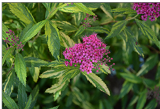
Double Play Painted Lady Spirea flowers