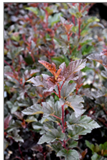
Petite Plum Ninebark foliage