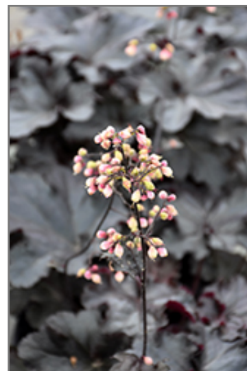
Black Pearl Coral Bells flowers