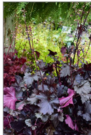
Black Pearl Coral Bells in bloom

Black Pearl Coral Bells is recommended for the following landscape applications;