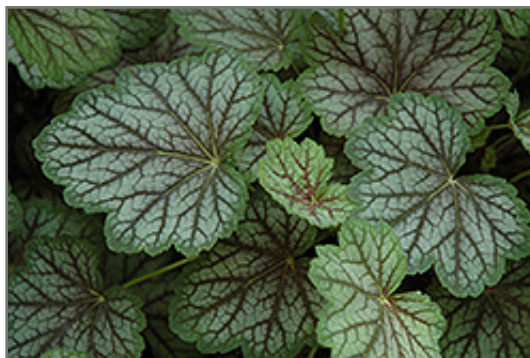
Green Spice Coral Bells foliage