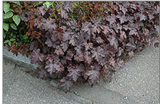
Stormy Seas Coral Bells