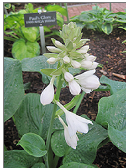
Elegans Hosta flowers