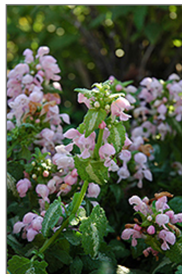
Shell Pink Spotted Dead Nettle flowers