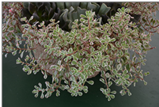
Tricolor Stonecrop