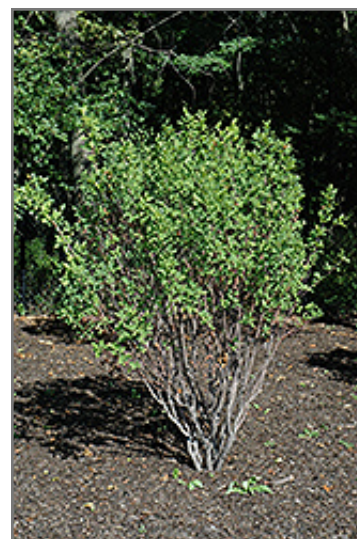
Rainbow Pillar Serviceberry

Rainbow Pillar Serviceberry is recommended for the following landscape applications;