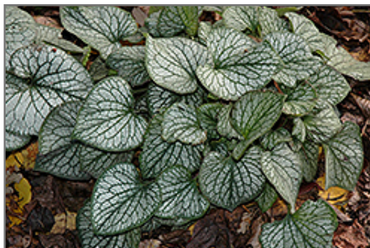
Jack Frost Bugloss