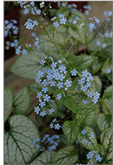
Jack Frost Bugloss flowers

Jack Frost Bugloss is a fine choice for the garden, but it is also a good selection for planting in outdoor pots and containers. It is often used as a 'filler' in the 'spiller-thriller-filler' container combination, providing a mass of flowers and foliage against which the thriller plants stand out. Note that when growing plants in outdoor containers and baskets, they may require more frequent waterings than they would in the yard or garden.