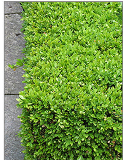
Green Velvet Boxwood foliage