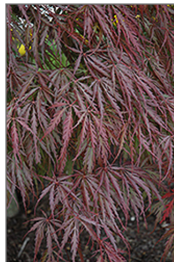
Tamukeyama Japanese Maple foliage