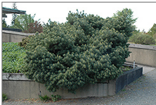
Blue Shag White Pine

Blue Shag White Pine will grow to be about 5 feet tall at maturity, with a spread of 5 feet. It tends to fill out right to the ground and therefore doesn't necessarily require facer plants in front, and is suitable for planting under power lines. It grows at a slow rate, and under ideal conditions can be expected to live for 50 years or more.