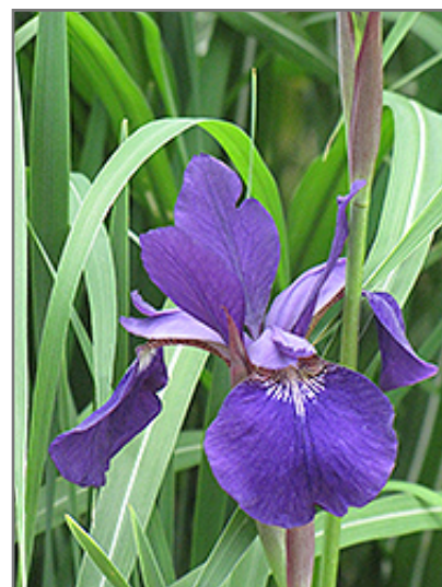
Caesar's Brother Siberian Iris flowers

Caesar's Brother Siberian Iris will grow to be about 28 inches tall at maturity extending to 4 feet tall with the flowers, with a spread of 24 inches. When grown in masses or used as a bedding plant, individual plants should be spaced approximately 18 inches apart. The flower stalks can be weak and so it may require staking in exposed sites or excessively rich soils. It grows at a medium rate, and under ideal conditions can be expected to live for approximately 10 years.