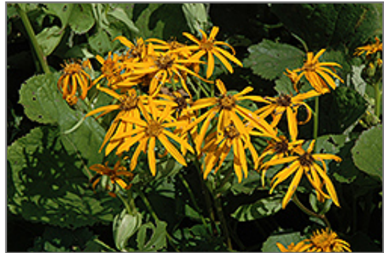
Othello Rayflower flowers

Othello Rayflower will grow to be about 30 inches tall at maturity extending to 4 feet tall with the flowers, with a spread of 30 inches. It grows at a medium rate, and under ideal conditions can be expected to live for approximately 20 years.