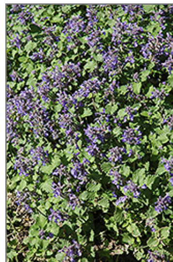
Little Titch Catmint in bloom