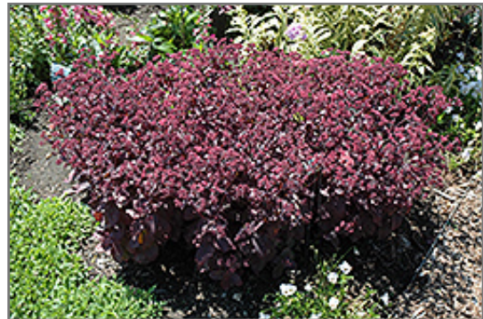
Xenox Stonecrop in bloom