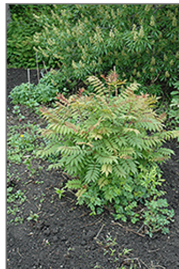
Sem False Spirea