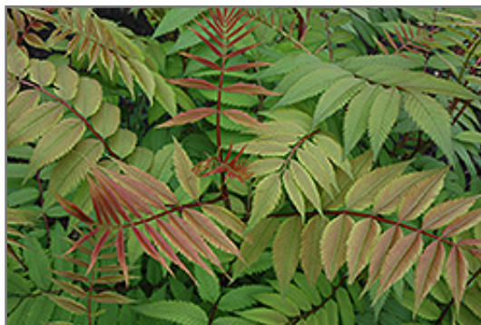
Sem False Spirea foliage

Sem False Spirea is recommended for the following landscape applications;