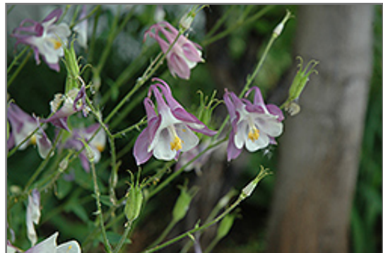
Common Columbine flowers

Common Columbine is recommended for the following landscape applications;