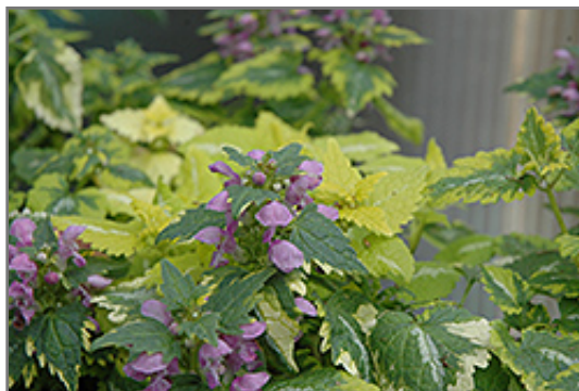
Anne Greenaway Spotted Dead Nettle flowers