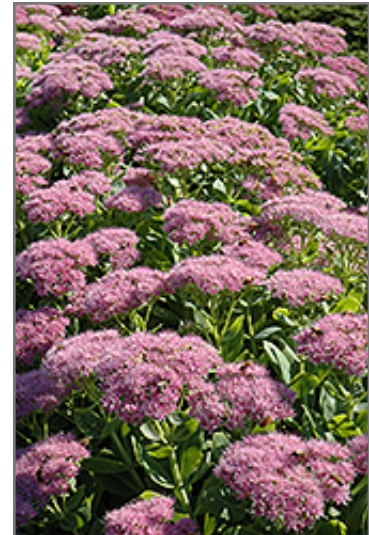
Brilliant Stonecrop flowers