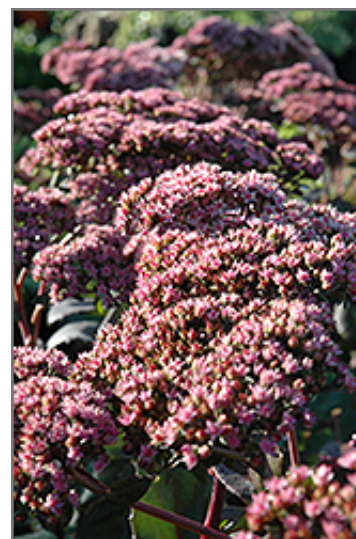
Maestro Stonecrop flowers

Maestro Stonecrop is recommended for the following landscape applications;