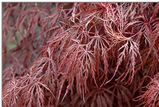
Crimson Queen Japanese Maple foliage