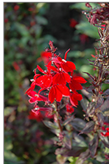
Queen Victoria Lobelia flowers