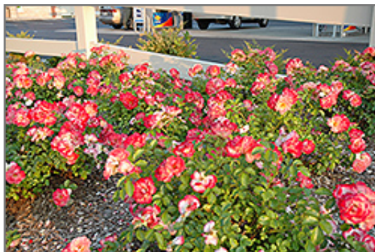
Flower Carpet Coral Rose in bloom