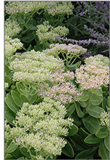
Crystal Pink Stonecrop flowers

Crystal Pink Stonecrop is a fine choice for the garden, but it is also a good selection for planting in outdoor pots and containers. It is often used as a 'filler' in the 'spiller-thriller-filler' container combination, providing a mass of flowers against which the larger thriller plants stand out. Note that when growing plants in outdoor containers and baskets, they may require more frequent waterings than they would in the yard or garden.