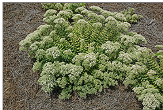
Crystal Pink Stonecrop in bloom