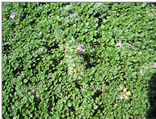
Elfin Creeping Thyme in bloom

Elfin Creeping Thyme is recommended for the following landscape applications;