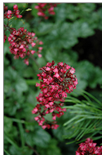
Paris Coral Bells flowers